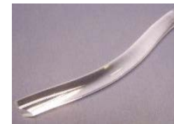
Replacement Handle Only for 5500L E5500D