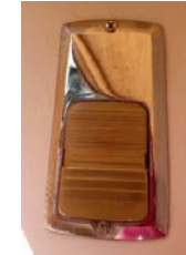
Lens only Mfg #: P-1328 Mfg. Fasteners Unlimited part - #P-1327 - Porch Light