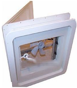
Jensen Vent 12V Fan Light \ SKU: V771412C2G1