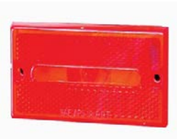
Clearance Lights/Side Marker Part numbers: MC48RBP and MC48ABP Manufactured by Optronics O'Reilly Auto Parts