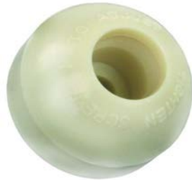
Pivoting Door Retainer Receiver JR Products/ search #10635