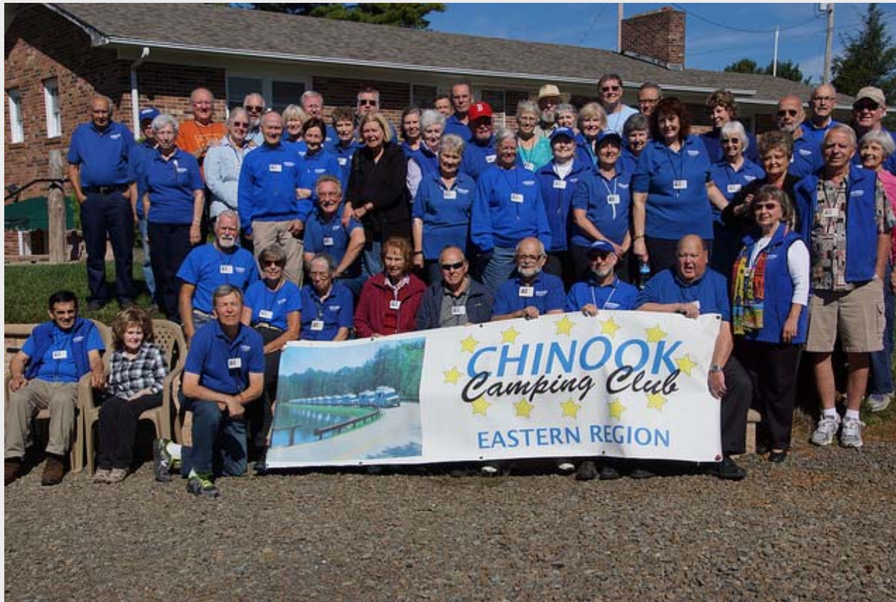
SEE THE FALL RALLY PHOTOS!>

Both are on Facebook as well, just search for their names.