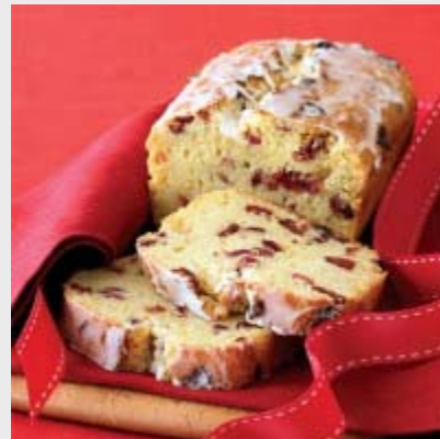
CHINOOK EATS: from Linda Stamper

Cranberry-Orange Bread with Grand Marnier 2 cups dried cranberries